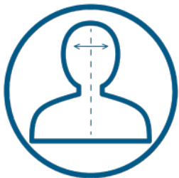
Symmetry & Coordination Tests

Integrate Core EMG with other systems in Noraxon's multi-device platform to enhance common clinical applications such as: