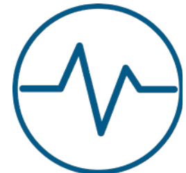
EMG Amplitude Analysis